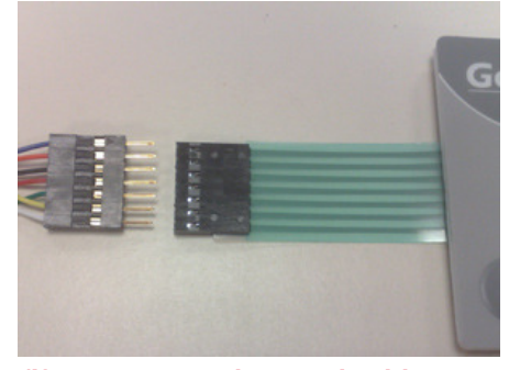
(If you connect the panel cable wrong way the red lamp on the panel will constantly light. It will not damage the product.)